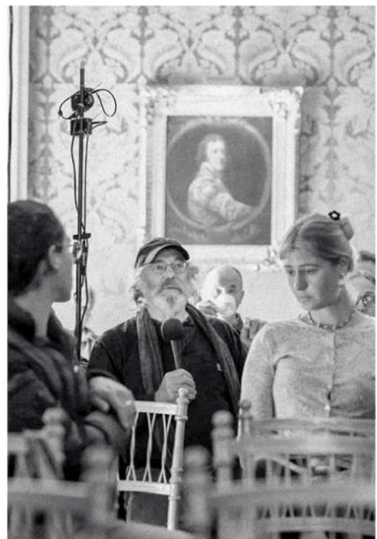
St Giles Dorset