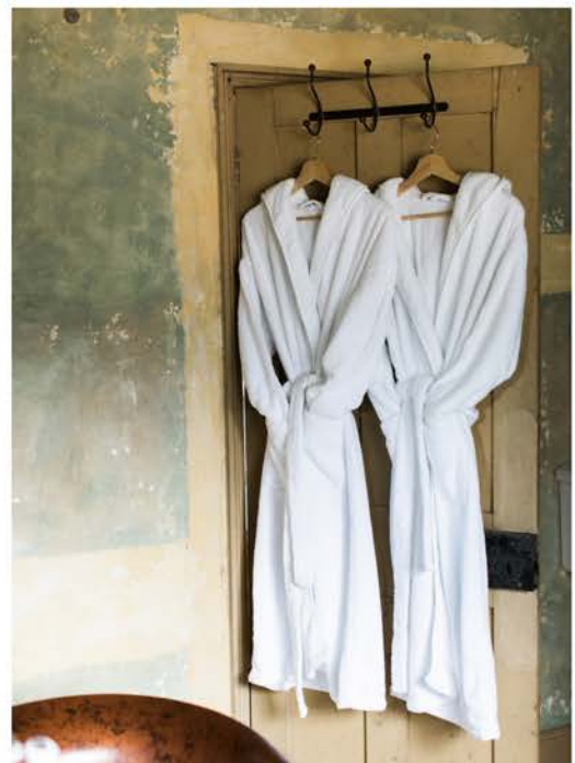
St Giles House